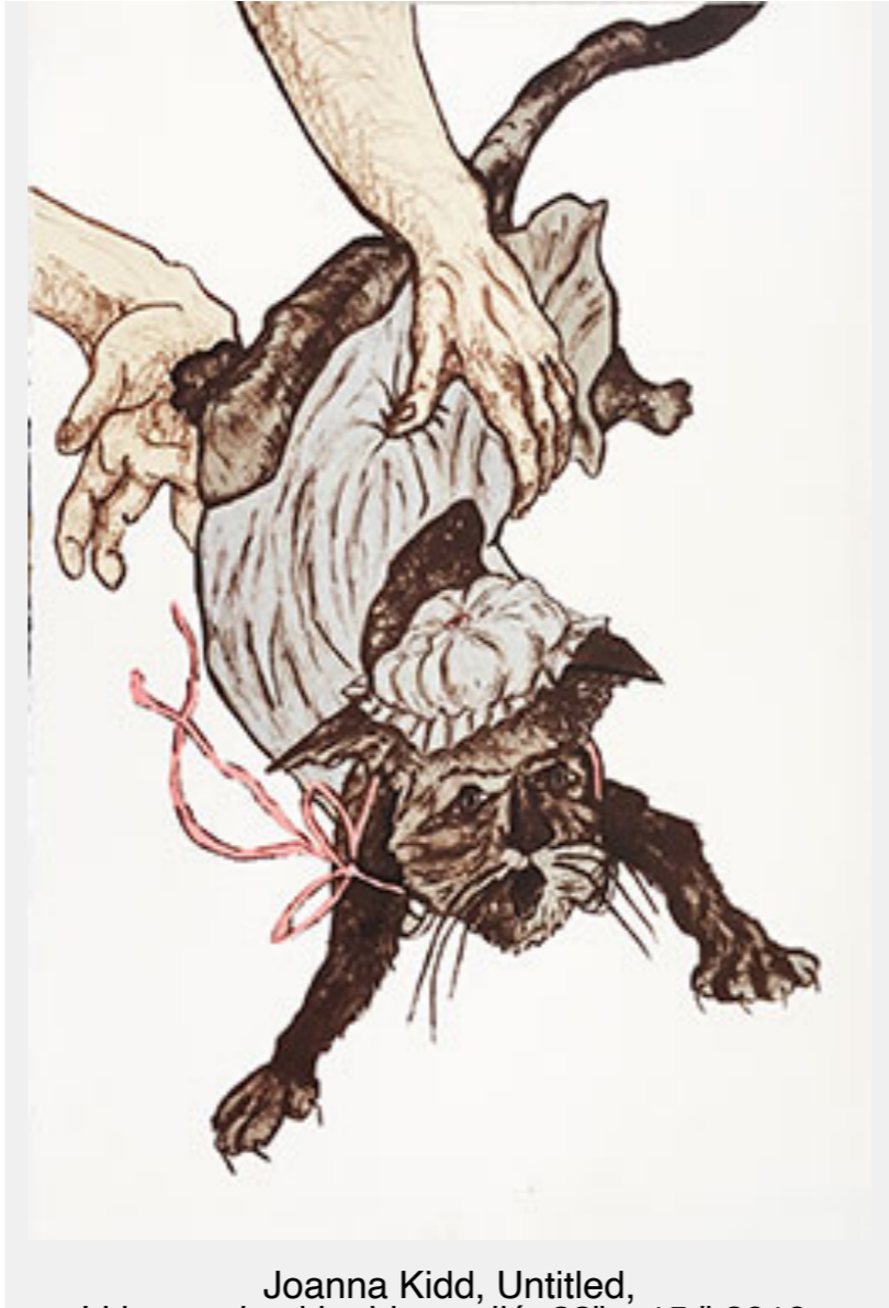
Joanna Kidd, Untitled , Lithograph with chine collé, 22" x 15," 2019.

Artwork image: Facts are Stubborn Things Monotype and Serigraph, 32.5" x 24" 2019