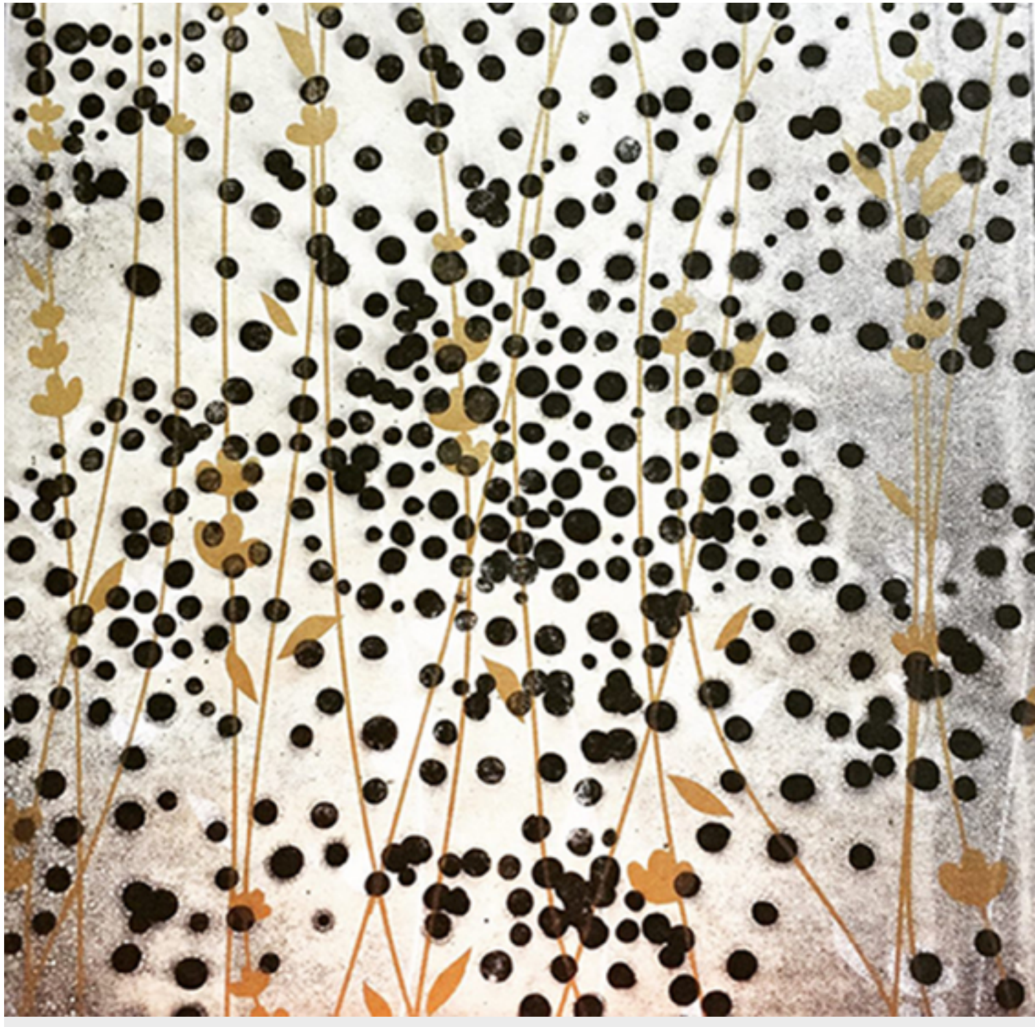
Anna Rochester, Market: Aerial View , etching with chine colle, 12" x 12", 2017.

Submit to: Bob Rocco, Editorial Board: bobroccoart@gmail.com