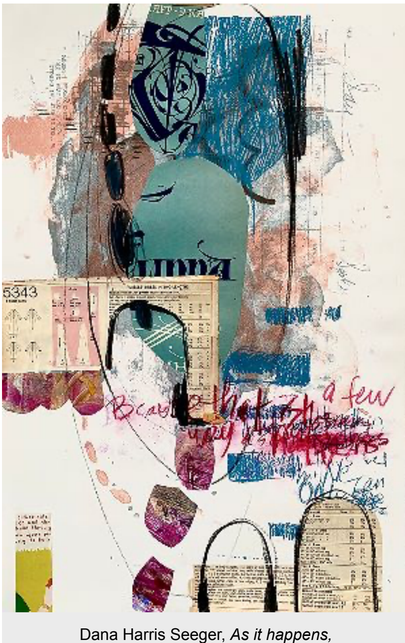
Dana Harris Seeger, As it happens, Lithograph with screen print and mixed media on paper, 22" x 15"

Virtual Printmakers in Conversation: Searching for Meaning in Our Changing World Environment Please join the artists in Searching For Meaning and juror, Dana Harris Seeger for a conversation about the selected work on view. Virtual events to be held via Zoom, join link to be posted at www.galleryrouteone.org.