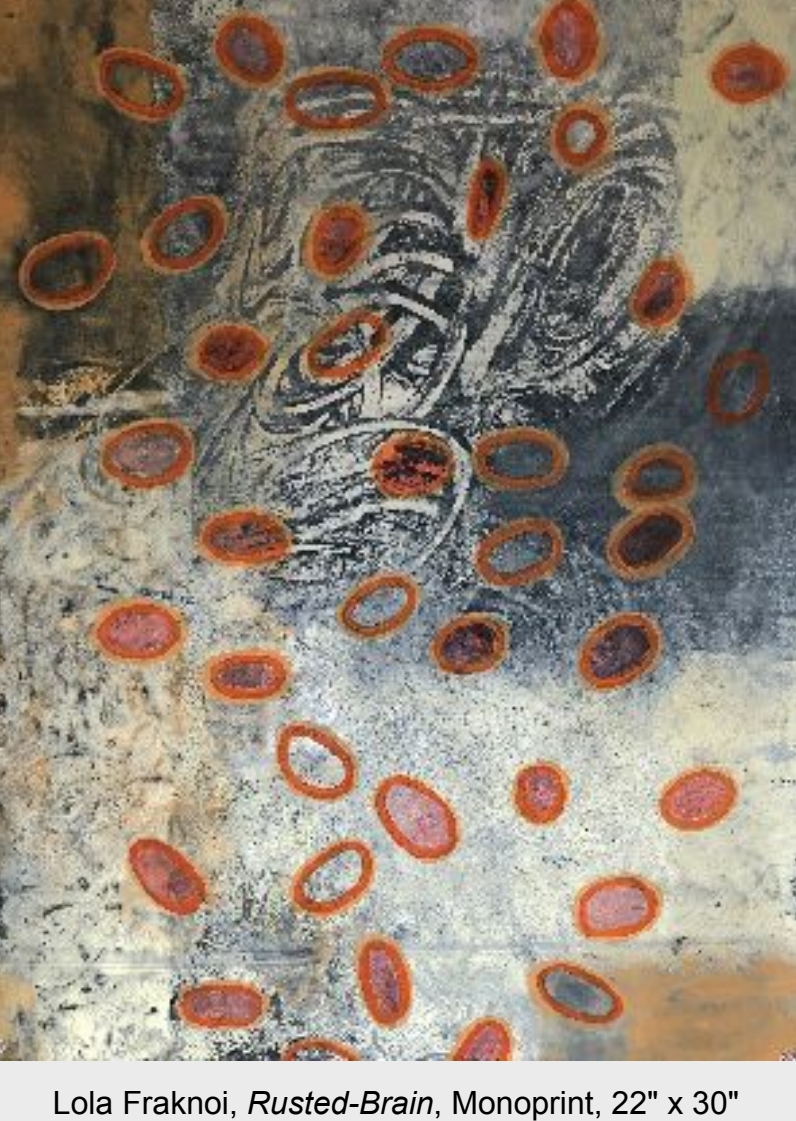
On exhibit at Gallery Route One

TRACES of Print Day in May Entry Deadline: May 20, 2021 Exhibition: June 15th–September 15, 2021