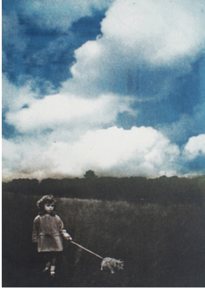
Monica Wiesbott, She was the Storm , Photopolymer etching, 6.75" x 4.75", 2018.

Photo of Thomas Wojak and Toru Sugita with a completed print.